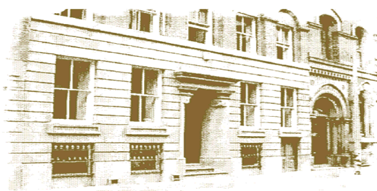
HENRY PILLING HOUSE BOOTH STREET, MANCHESTER M2 4AF

We pioneered Personal Equity Plans (PEPs) and their replacement Individual Savings Accounts (ISAs), and defined the development of this special market nationally. Our expertise in ISAs also covers "self-invested" Personal Pensions (SIPPs) of which many clients have already taken full advantage. In recent years we have added Child Trust Funds (CTFs) to the menu and more recently JISAs giving you the investment vehicles you need to look after all the family. However, we do not just give you sound information to enable you to choose your own investments, all administered by us, we also specialise in Investment Management and Discretionary Management services.