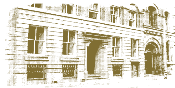
HENRY PILLING HOUSE BOOTH STREET, MANCHESTER M2 4AF

We pioneered Personal Equity Plans (PEPs) and their replacement Individual Savings Accounts (ISAs), and defined the development of this special market nationally. Our expertise in ISAs also covers "self-invested" Personal Pensions (SIPPs) of which many clients have already taken full advantage. In recent years we have added Child Trust Funds (CTFs) to the menu giving you the investment vehicles you need to look after all the family. However, we do not just give you sound information to enable you to choose your own investments, all administered by us, we also specialise in Investment Management and Discretionary Management services.